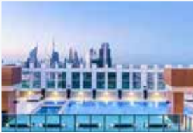
Sheraton Hotel Dubai City