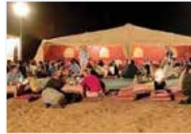
Overnight Desert Camp Dubai