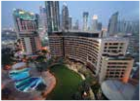
Le Royal Meridien Beach Resort Hotel Jumeirah Beach, Dubai